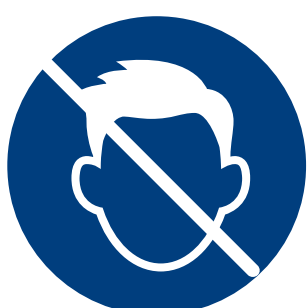
DON'T TOUCH FACE