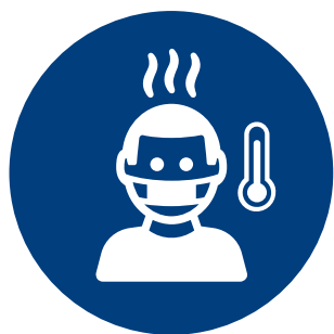
AVOID SICK PEOPLE