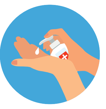
Wash your hands with soap and water or hand sanitizer

If the mask is not soiled, damaged or hard to breathe through it should be carefully folded so that the outer surface is held inward against itself to reduce contact with outer surface and can be stored in a paper bag between uses